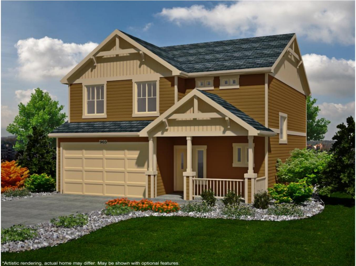
*Artistic rendering, actual home may differ. May be shown with optional features.

Plan Name: Granby (903) Bedrooms: 3-5 Bathrooms: 2.5-3.5 Garage: Square Feet: 1960-2722 Base Price: $ 218,100.00